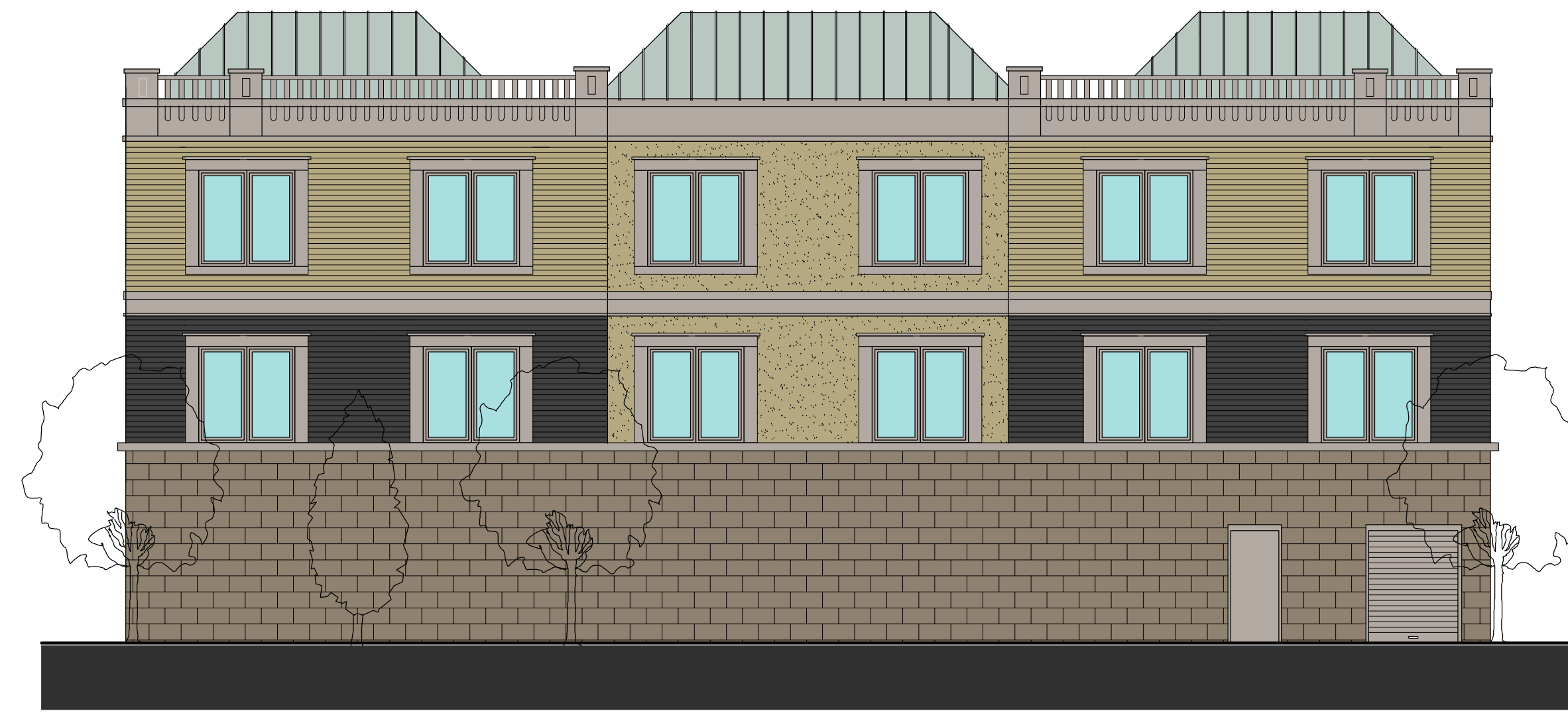
2 SIDE ELEVATION SCALE: 1/8" = 1'-0"