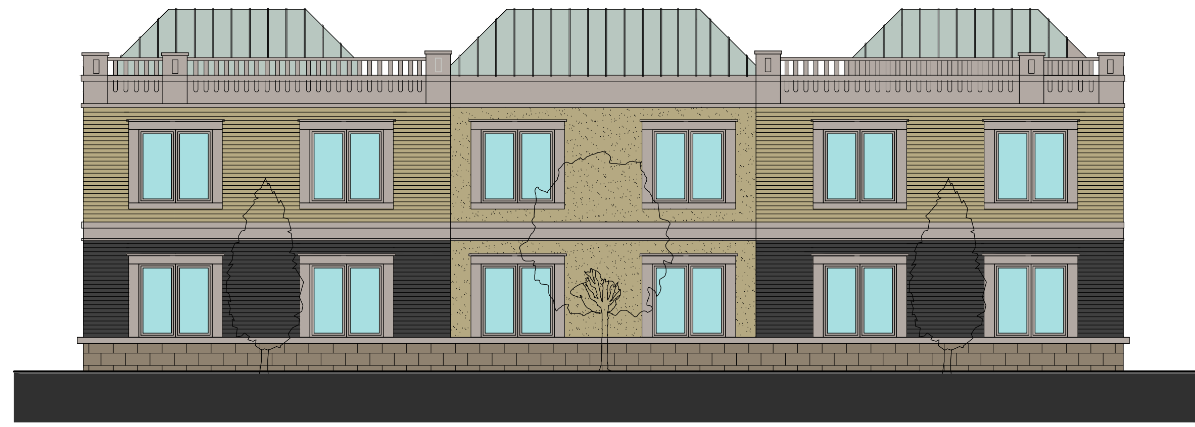
1 SIDE ELEVATION SCALE: 1/8" = 1'-0"