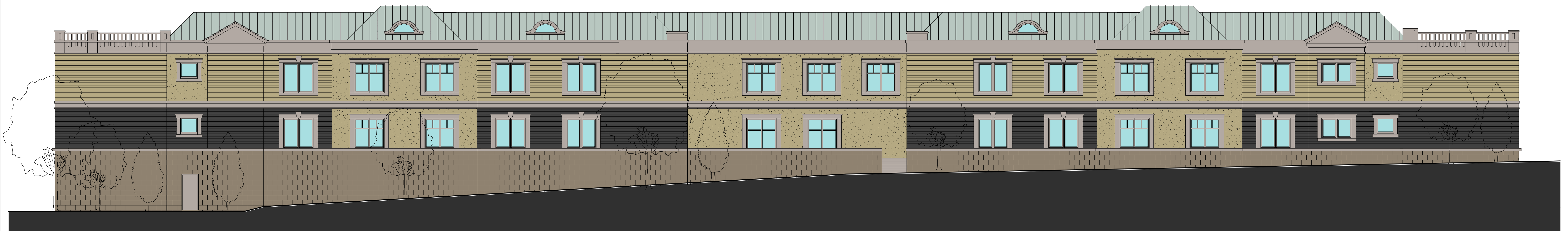
4 REAR ELEVATION SCALE: 1/8" = 1'-0"

CIVIL ENGINEER STRUCTURAL ENGINEER M/P/E ENGINEER