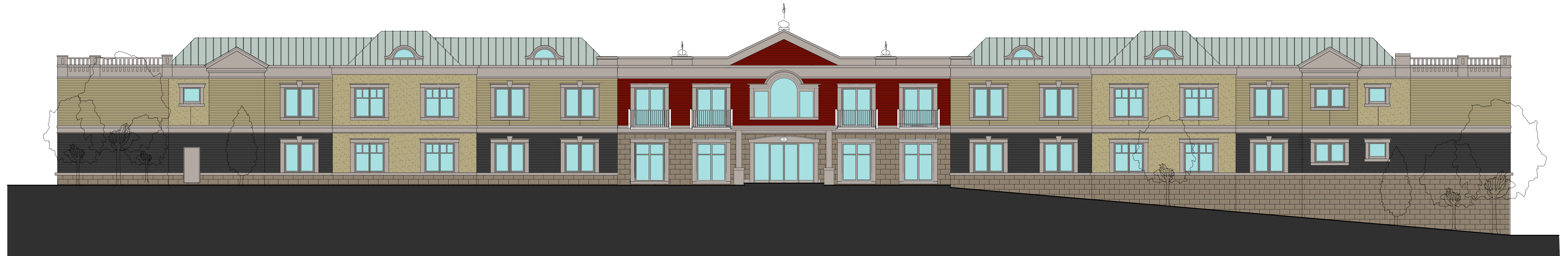
3 FRONT ELEVATION SCALE: 1/8" = 1'-0"